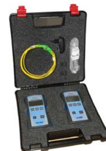
TE-HC-03 hard case for two testers

Compliant with RoHS-requirements (2002/95/EG, 27.01.2003)