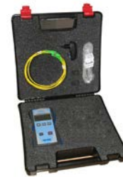
hard case for one tester 1

Note: 1) standard accessories, allows storage of one tester