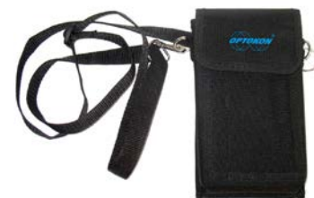
TE-OB-01 soft case for one tester