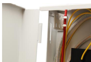
Removable door detail view