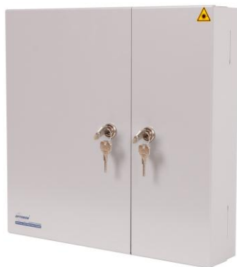
MPIC – total view