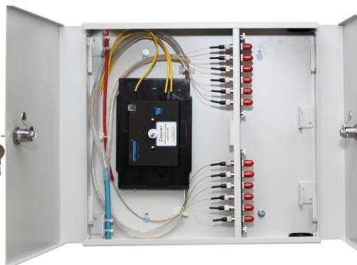
MPIC – equipped demo