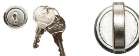
Lock with keys