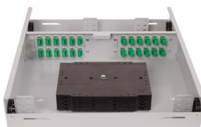
Internal layout (back view)